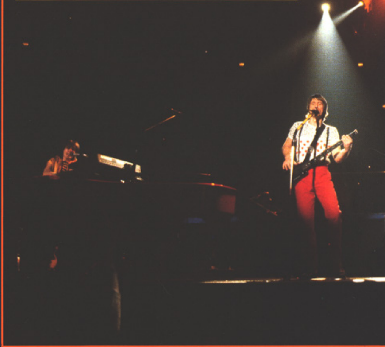
© 1983 Artists & Friends/Nightmare, Inc.